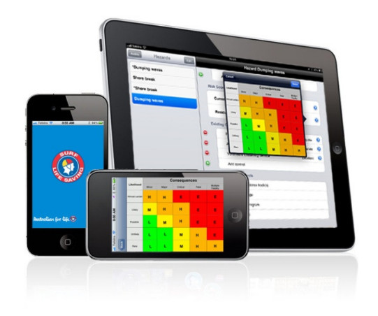
Figure 4: SLSA's suite of risk management tools for iPhone and iPad.

Risk management is a key element of the strategies to reduce injury and loss of life or other adverse impact in the aquatic environment. It is a central component of the drowning chain and used to identify threats to life and strategies to mitigate those threats in a targeted and effective manner. Surf Life Saving has been providing commercial coastal public safety risk management services to organisations (i.e. Local Government) for more than a decade. At the same time there has been an increasing requirement for our members to assess and manage risks for events and member activities. Traditionally these assessments have involved complex paper based forms and there has been a wide variation in the quality of assessment being produced.