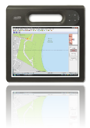
Figure 3: An example of a ruggedised tablet.